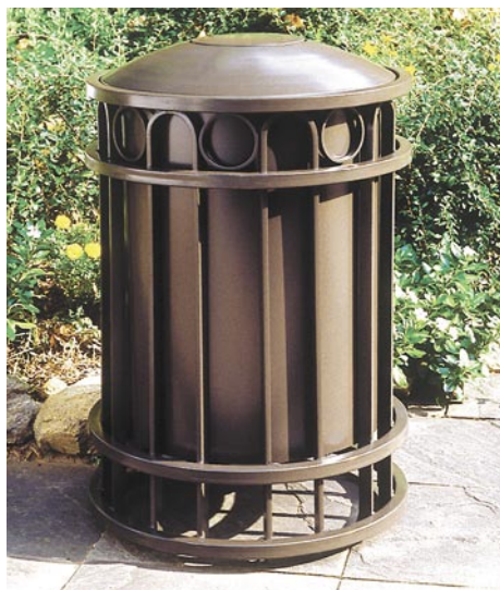
PSO-24 with OPTIONAL convex lid with self-closing door.