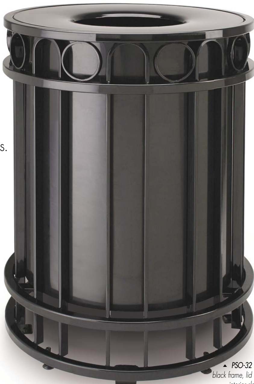
▲ PSO-32 with black frame, lid and interior sleeve.