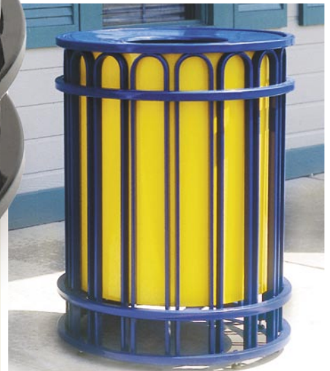
PSA-32 with OPTIONAL 2-color configuration (blue frame and lid, custom yellow interior sleeve).