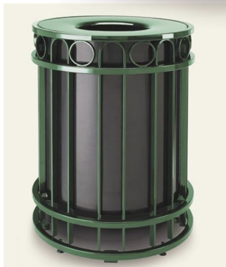
PSO-32 with OPTIONAL 2-color configuration (green frame and lid, black interior sleeve).