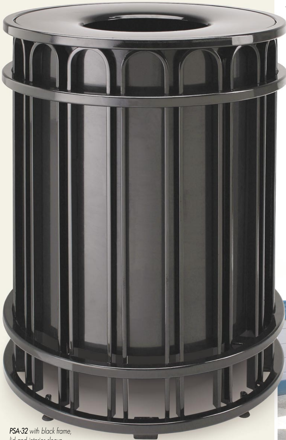
PSA-32 with black frame, lid and interior sleeve.

Design detail that contrasts against the solid interior sleeve