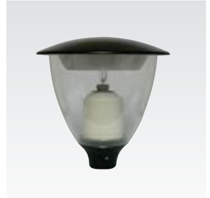
P707 Camino Reflector