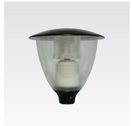
P707 Camino Refractor