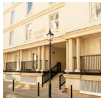
P514 on Promenade column