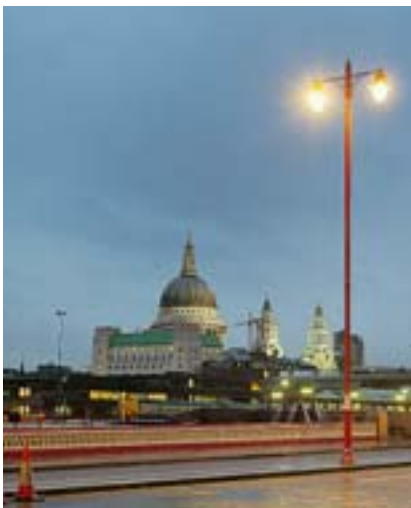
P510/TE Blackfriars Bridge