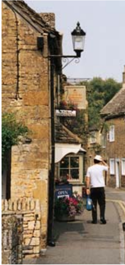
P111 Burton on the Water