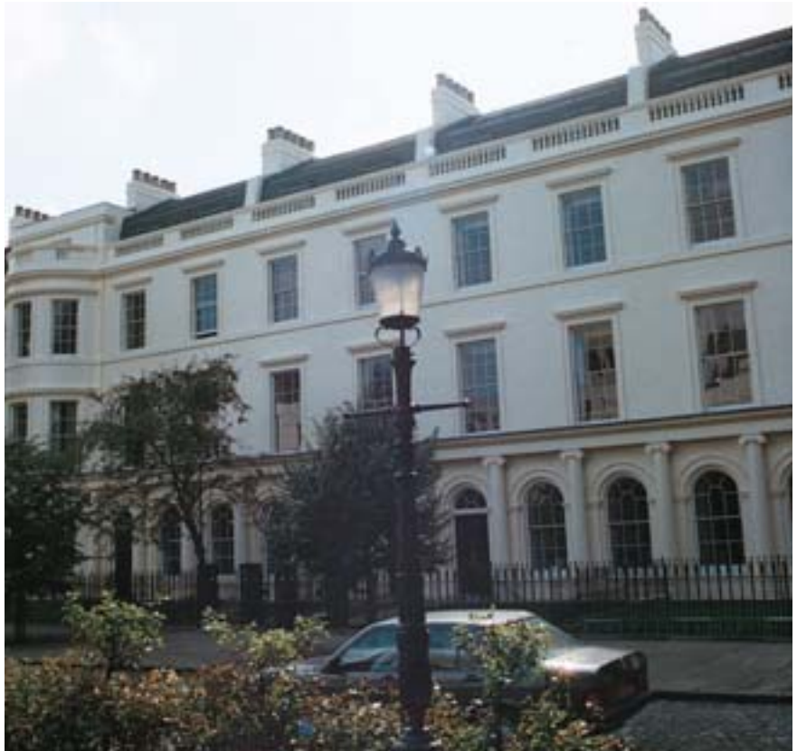
P111 Special in Regents Park