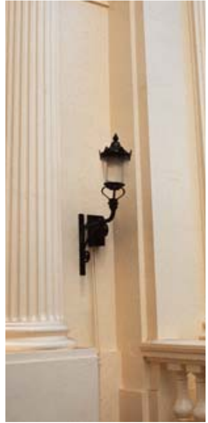
P111 Special on Wall Bracket